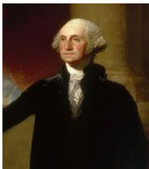
Lansdowne portrait from The National Gallery

Washington's approach was a blueprint — one that should be valuable to our leaders and communities today. We owe him so much for exemplifying such ideals and setting an example for a fledging nation to follow. AND it should be an example that should be followed today and through the centuries to come.