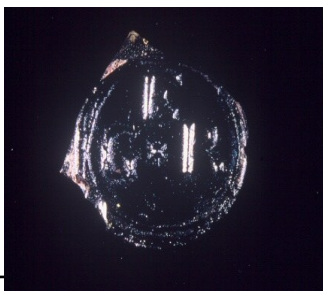
SEAL FROM ESKRIDGE WINE BOTTLE FOUND AT STRATFORD HALL