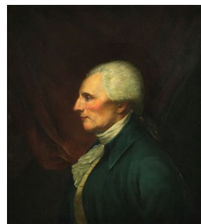
Richard Henry Lee fag# 1168